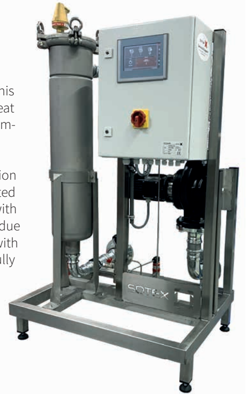
Cleanomat Pro 36

The units are similar to the structure of the SFU (P) + series and are supplied in the following capacities: 6, 12, 20, 36, 54, 72 and 108 m 3 / hour.